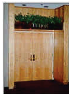
English Harewood Sycamore Book Match

Because the "tight" and "loose" faces alternate in adjacent veneer, they may accent stain differently, and this may result in a noticeable color variation called barber poling.